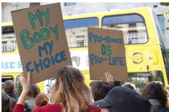
Abortion rights demonstration, Ireland